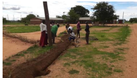
Teachers and Parents in Katete during ILUD training Dec 2019

Turn water shortage into abundance by harvesting from the roof, stopping the rain by growing trees, spreading water by digging swales, sinking water into the soil.